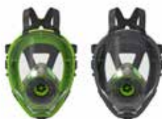
Full face masks BLS 5400 - BLS 5150