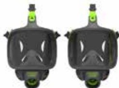
Full face masks BLS 3400 - BLS 3150 (V)