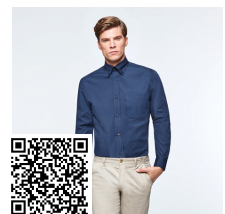
AFOS L/S CM5504