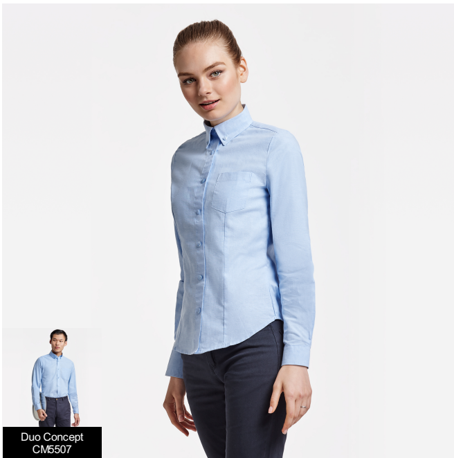
Duo Concept CM507