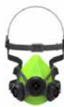
Half mask BLS SGE46