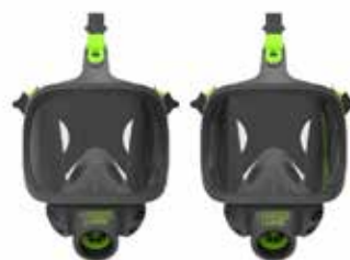
Full face masks BLS 3400 - BLS 3150 (V)