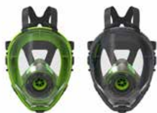
Full face masks BLS 5400 - BLS 5150